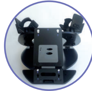
Tilting System: independent adjustment of arm and board height.